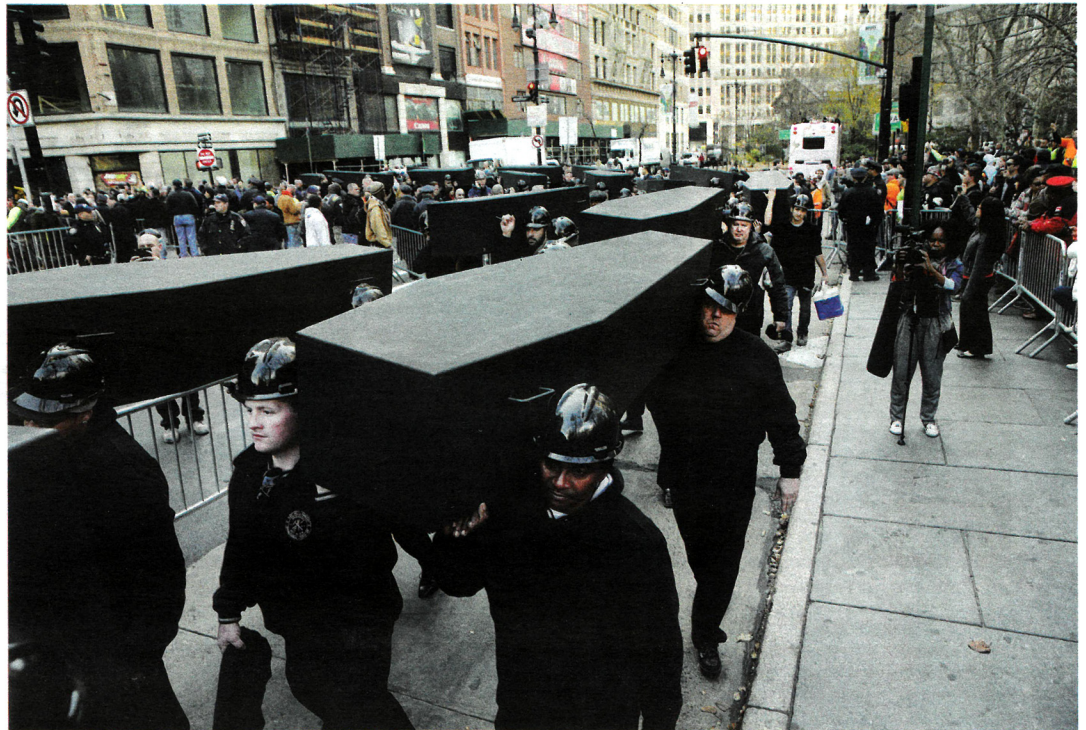
FATAL FACTS: Unions fight for more safety on project sites by carrying coffins during protests and saying that most fatalities occur on nonunion sites (top). Essex Crossing is a nearly 2 million-square-foot mixed-use project that is being built open shop (right).

The contest for open shop will be tested